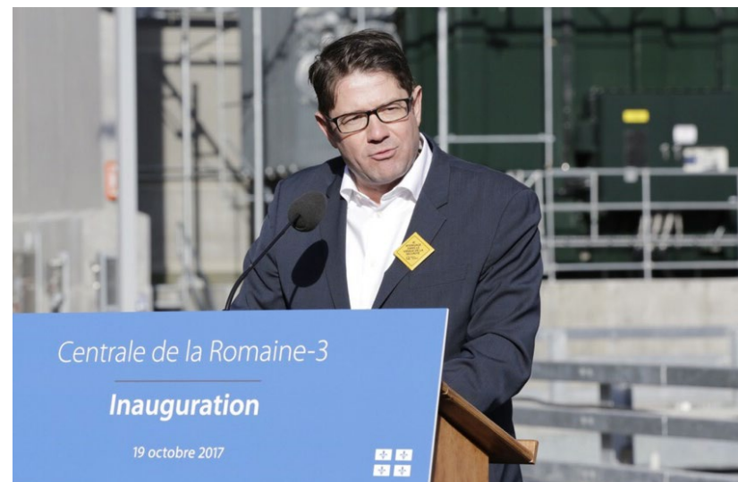
Éric Martel, President and Chief Executive Officer, at the inauguration of Romaine-3 generating station.

The strong performance of our subsidiary TM4 on external markets should also be commended. TM4 sold 4,300 of its electric bus motors to China in 2016. The market potential in China is impressive, with 100,000 electric buses expected to be put on the road each year.